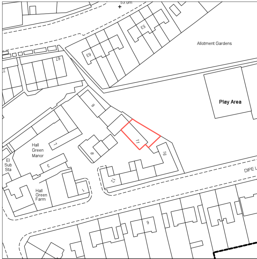
11, Hall Green Manor, West Boldon, East Boldon